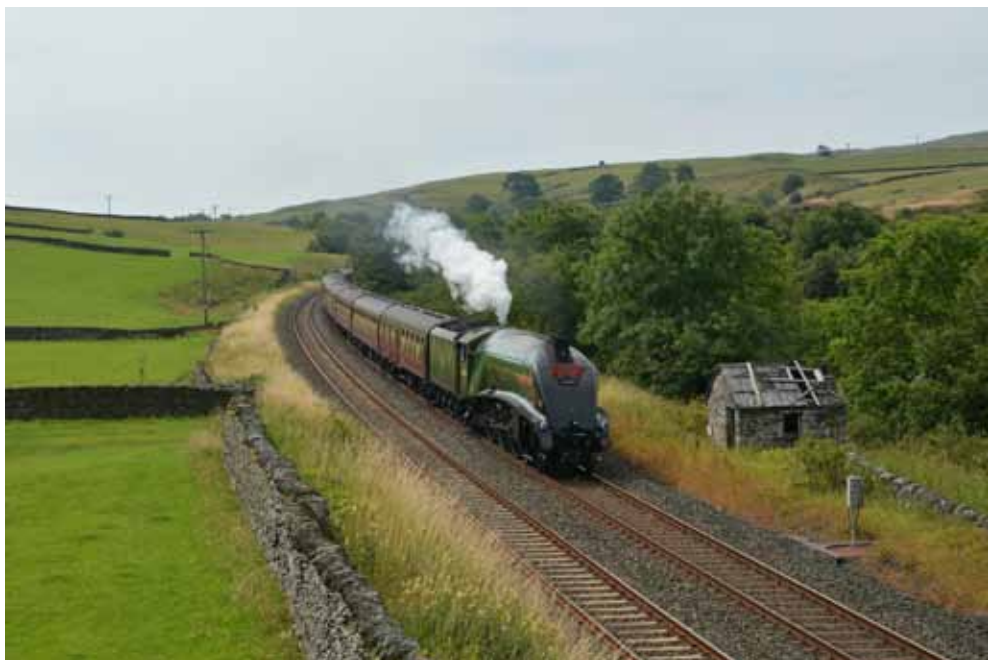
Below: 60009 Union Of South Africa passing Helwith Bridge in the most beautiful weather on the northbound Cumbrian Mountain Express on Saturday 26th July.