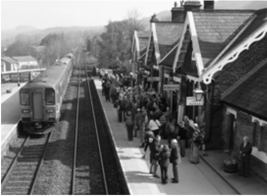
Waiting for the launch of the 2014 Ride2Stride Festival at Settle Station.

This year's Ride2Stride which took place from 29th April to 5th May was the third Settle-Carlisle Walking Festival. The festival is a week-long celebration of the landscapes and culture of the Western Dales and Eden Valley and with 873 people taking part, 2014 was the busiest so far.