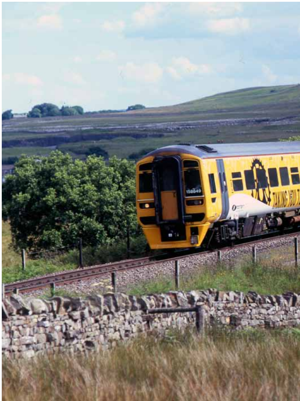
Northern Rail provided a special yellow "Tour de France" livery on 158.849 to mark the cycle race in Yorkshire; seen on the 14.49 Leeds - Carlisle near Ribbleshead on 30/6/14.