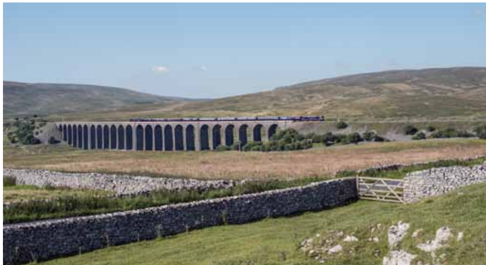
Above: With most of the work being done by diesels at the back of steam trains, this summer has so far been a disappointment for steam photographers. However, whilst waiting for an 8F (again diesel-assisted), there was the bonus of the Royal Train taking H.M. The Queen to the Commonwealth Games in Edinburgh on Wednesday 23rd July.