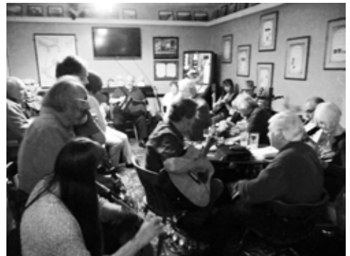
Great to finish with music at the end...much appreciated.

At the end of every day's walking the singers and musicians from the 3 Peaks Folk Club gathered in a pub near the station. Over the week, the core group were joined by performers from as far afield as Derbyshire and the North East and Saturday night saw 38 musicians in the Station Inn at Ribbleshead performing songs and music for the walkers who had taken part in the 5 walks on offer that day.